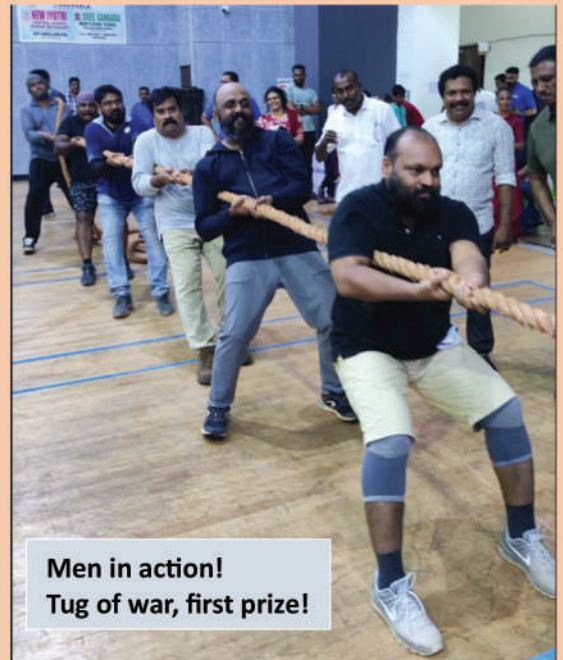
Men in action! Tug of war, first prize!